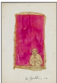
Ida Applebroog, American, born 1929. Untitled , 1978 Ink and acrylic on Mylar with Plexiglas, paper and glue The Nina Yankowitz Collection of Women’s Art 1970s Onward