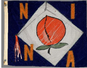
Ree Morton, American, 1936–1977 Flag for Nina from the installation Flagship , 1975 Acrylic and embroidery on nylon The Nina Yankowitz Collection of Women's Art 1970s Onward